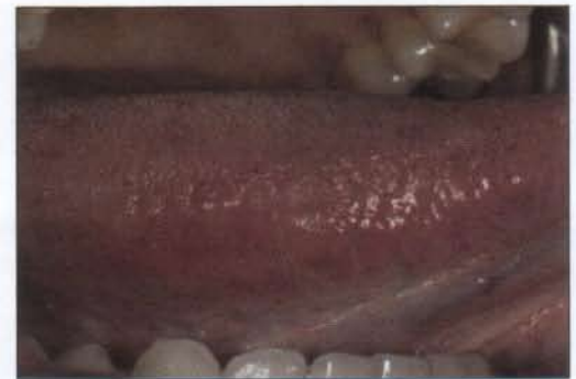
Figure 3. Image of normal tongue.

that would have otherwise been judged clinically as negative for dangerous change. Among these cases, 4 specifically come to mind that illustrate the value of the VELscope in the assessment and follow-up of patients who present with oral lesions.