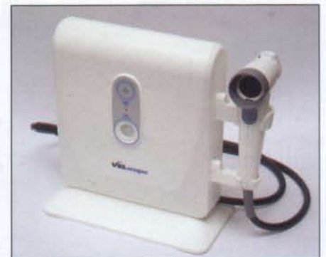
Figure 1. The VELscope unit.

Association states that 60% of the US population sees a dentist every year. This obviously provides a potential to include cancer screenings and detection of oral cancer in its early stages. Unfortunately, published studies indicate that currently less than 15% of those who visit a dentist regularly report having had an oral cancer screening. It is now commonplace for women to get an annual PAP smear for cervical cancer or a mammogram to check for breast cancer. In addition, many men at risk receive an annual prostate-specific antigen (PSA) test and digital rectal exam for prostate cancer. These screening efforts have been possible due to public awareness of the value of catching cancers in their earliest forms as well as effective technologies for conducting the examinations. Oral cancer is not different in this regard. In fact, it is potentially easier to obtain patient compliance because unlike many other cancer screen-