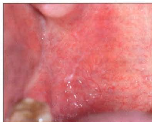
Figure 5. Area appearing normal under white light.