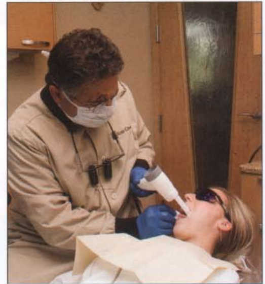
Figure 2. VELscope in clinical use.

For the past 2 years we have been fortunate to have had access to a prototype VELscope unit, and for the past 4 months we have used the newest version of the scope in our clinic. The VELscope has been very helpful in improving our assessment of patients with chronic oral tissue changes and in deciding whether the tissue changes observed using visual inspection are valid or understate the risk of malignant disease. The scope does not ensure that all clinical decisions regarding potentially malignant oral lesions are correct, but it has resulted in diagnoses of malignant disease or very aggressive dysplasia in a number of cases